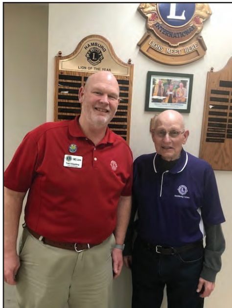
Lion Otto Mackenthun Membership Key Award